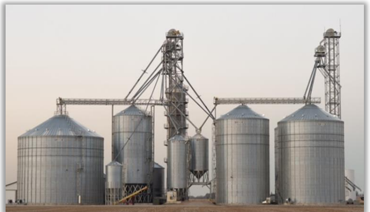
Photo: Multi-generational Indiana client's grain setup. When he started with Alkire Advisory, he had 100,000 bushels of grain storage. He is now up to 1.2 million bushels of on-farm grain storage and still growing.

As a fee-based adviser, we encourage using the lowest cost and most profitable marketing alternative for each client. Some clients can only use cash contracts. Our most sophisticated clients utilize futures and options to manage price risk, which is often the lowest cost and most profitable marketing tool.